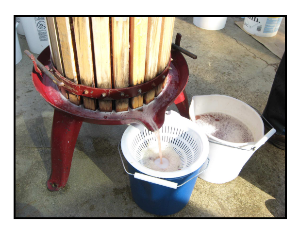
Grape Skins - More Valuable than Gold

You will need the skins from 100 - 200 pounds of grapes (these can be fresh or frozen) and an inexpensive kit of a compatible wine.