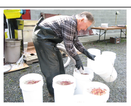
Gett'n 'er done with Nanaimo Winemakers' friends and members.